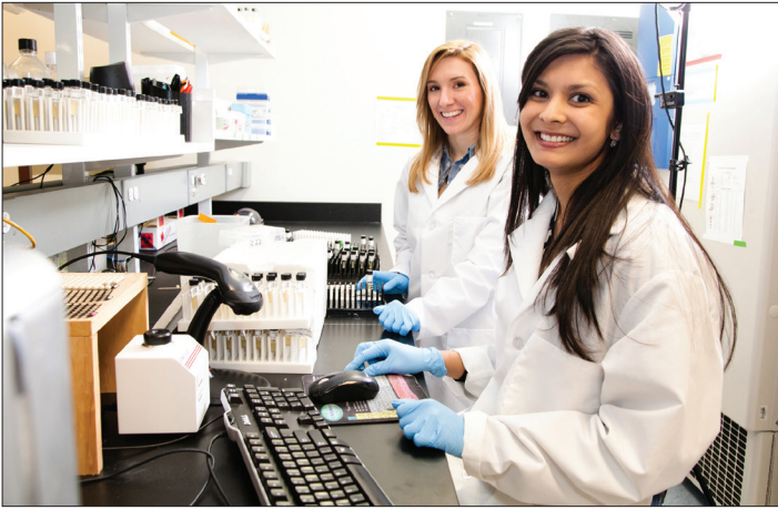
Addgene, a nonprofit plasmid repository, is rapidly growing with more than 65 employees in its Cambridge office.